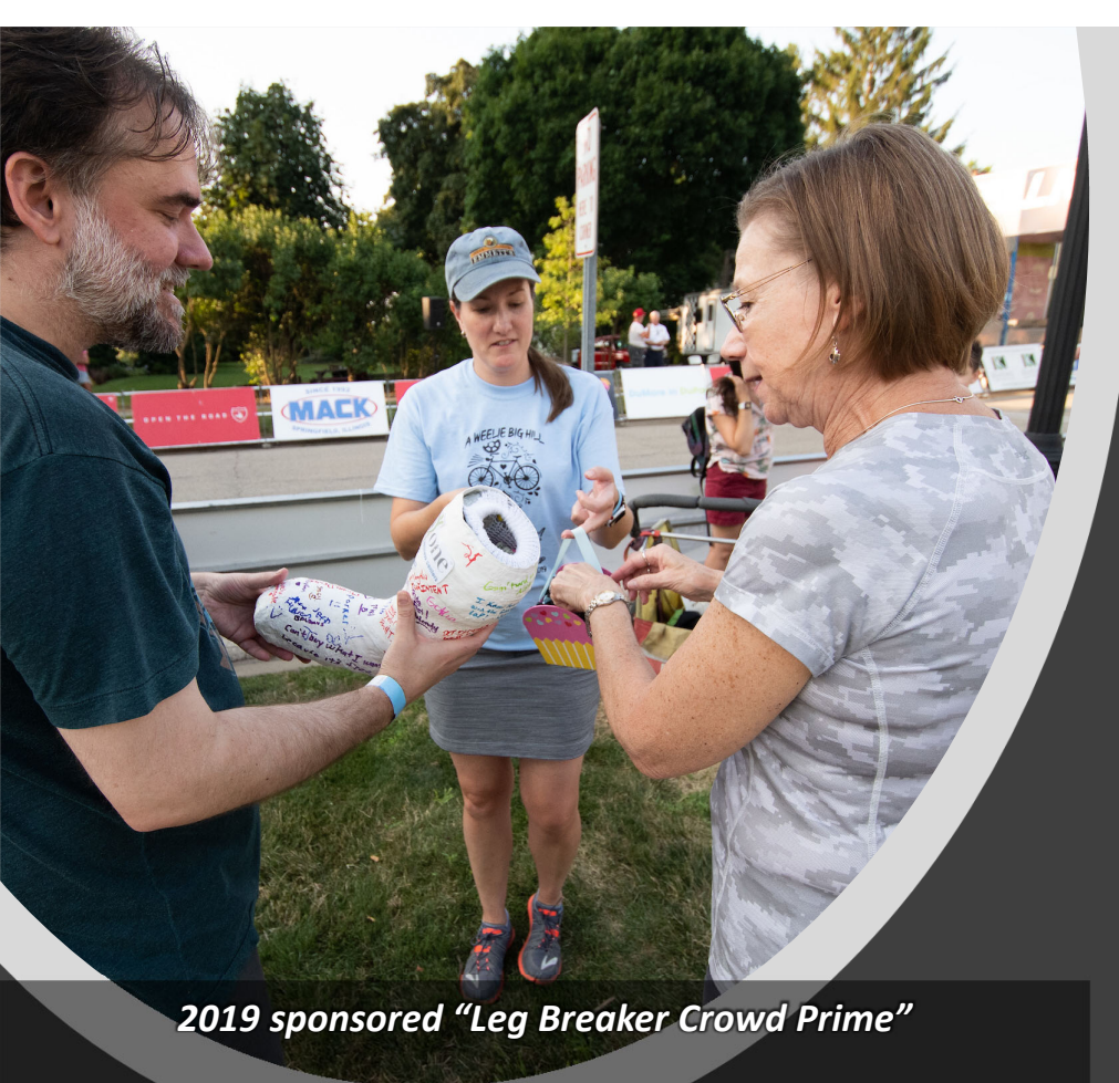
2019 sponsored "Leg Breaker Crowd Prime"