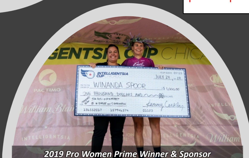
2019 Pro Women Prime Winner & Sponsor

The possibilities for creativity are endless with primes. We will work to create the perfect sponsorship for you!