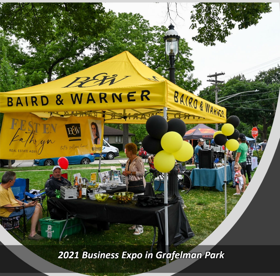
2021 Business Expo in Grafelman Park